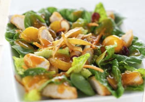
Asian Chicken Salad